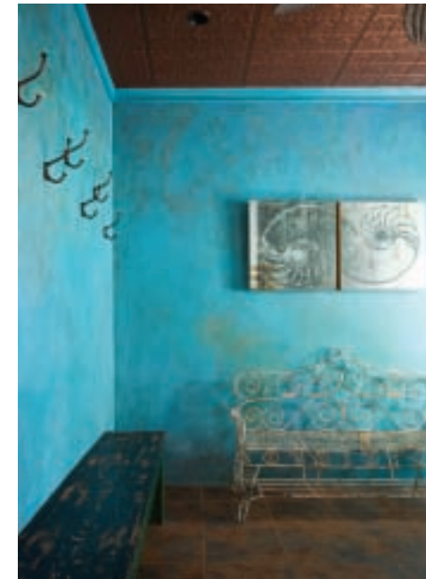
Imitation-tin ceiling tiles enhance the blueness of the dressing room walls. Opposite: Mark Giorgetti chose pine floors from a sustainable source. The shades are handwoven from Nepalese yarn.